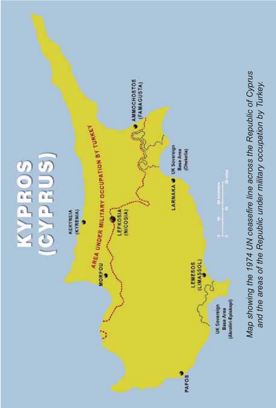
Map showing the 1974 UN ceasefire line across the Republic of Cyprus and the areas of the Republic under military occupation by Turkey.