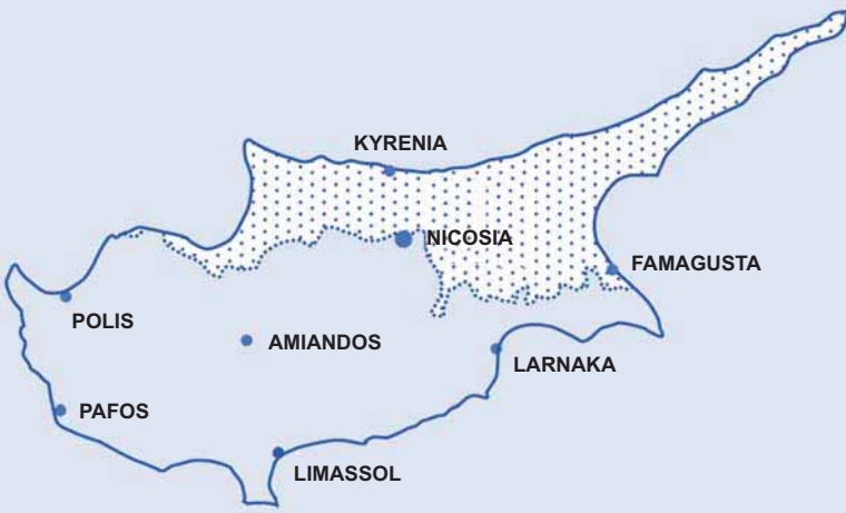
The dividing line as established by Turkey's invading army in 1974. The shaded area in the north is still under military occupation by Turkey.